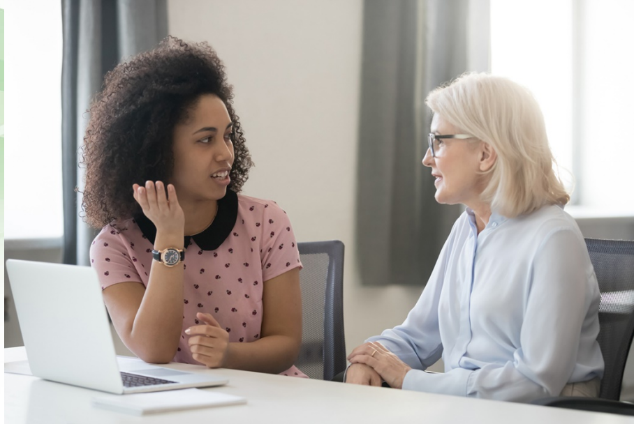
Photograph is open access

Use this presentation with the course workbook